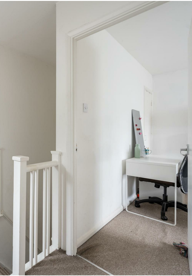
Bedroom 7'6" x 10'0"